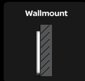
False Wallmount Solid Wallmount Deskmount